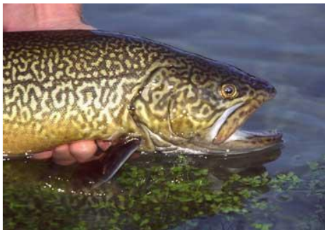
THE STOCKING OF TIGER TROUT!