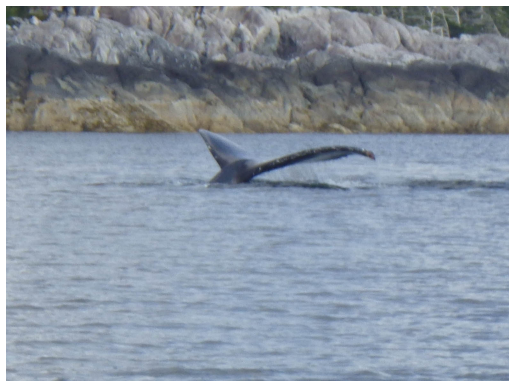
The one that got away?