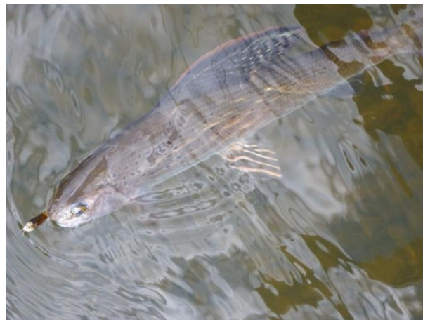
A nice LSR Grayling