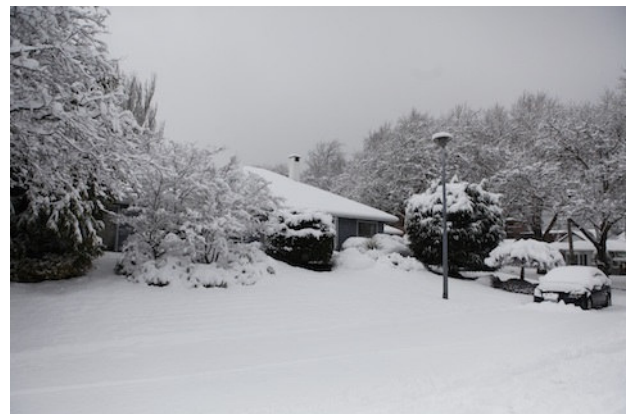
So you think Victoria doesn't get snow? Two days before I saw fishermen on Elk Lake though.