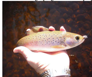
Grayling caught somewhere west of Edmonton