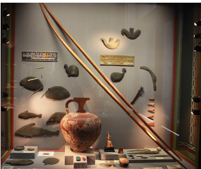
3000 Year Old Egyptian Fishing Equipment