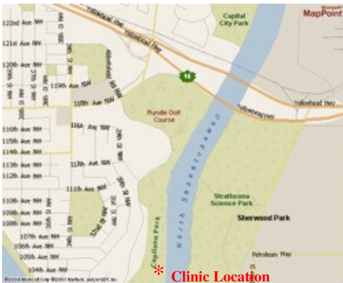
Map to Rundle Park Clinic Location