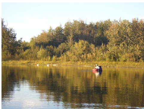
Photo from 2005, Fish seem slightly larger this year