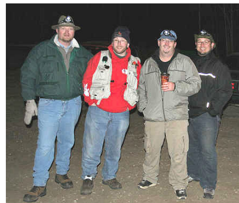
Midnight Muir Madness Participants