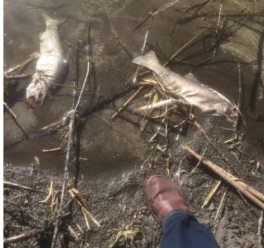
Murders at Muir!

A big concern is winterkill of the trout due to minimal or no aeration this past winter.