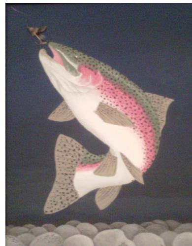
Acrylic on Canvas by Tori Robinson