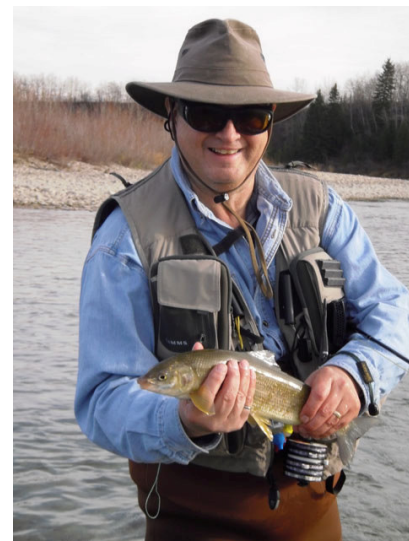
A Nice November Rocky