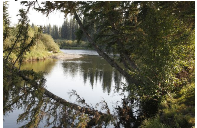
An artsy view of the well known location