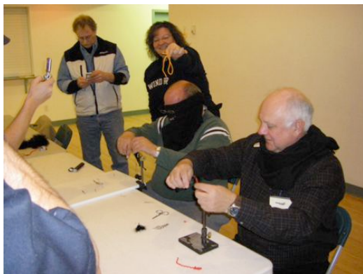
So who exactly is blind?