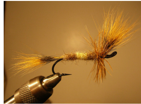
Steelhead Bee - the first of six Salmon Fly Patterns some members will be tying in January from the Canadian Postage Stamp Series