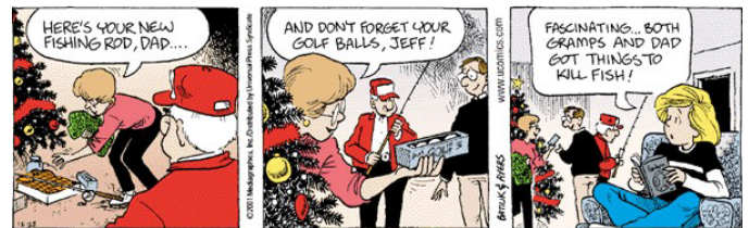
Crankshaft Cartoon from Edmonton Journal Dec. 22, 2001